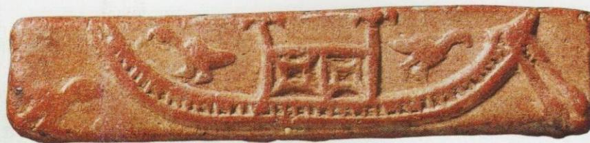
Seal Depicting Boat, Mohenjadaro