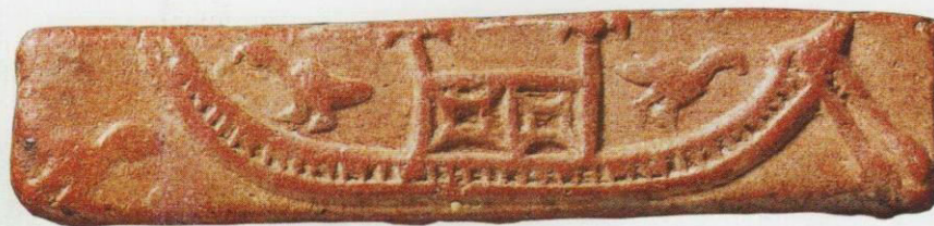
Seal Depicting Boat, Mohenjadaro